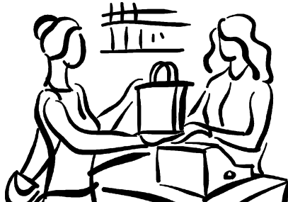
Food Services Cashier