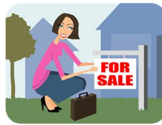
REAL ESTATE AGENT

If your roof is leaky and inside it drips. who do you call before someone slips?