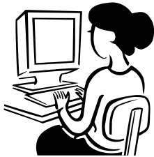
Computer Support Specialist