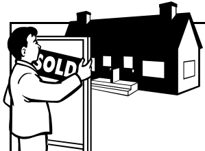
Real Estate Agent