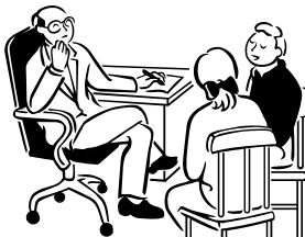
Family Services Worker