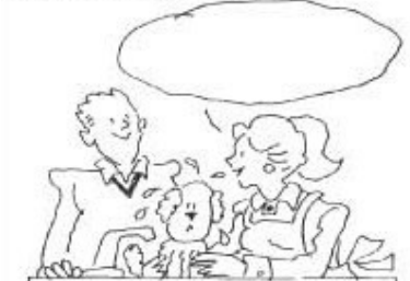
Animal Shelter Manager