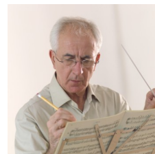
Song Writer Producer