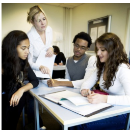
High School Teacher

SOLs ADDRESSED IN THIS ACTIVITY: 2nd Grade-English 2.4, 2.11; 3rd Grade-English 3.3, 3.10; 4th Grade-English 4.3, 4.8; Career Development K-3:EC1; Career Development 4-5: EC9, EC10