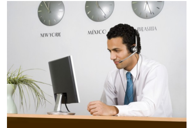
Customer Service Representative